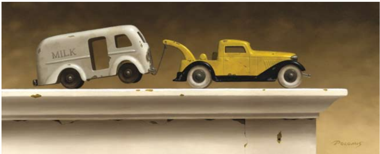
TED POLOMIS, GOT MILK, OIL ON PANEL, 10 X 24"