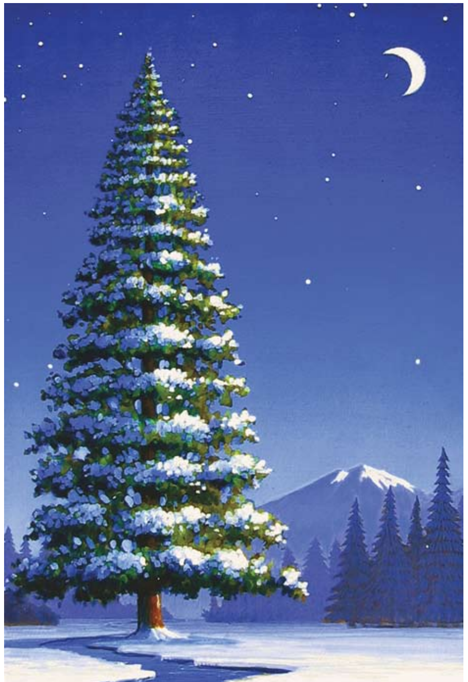
ROBERT LADUKE, WINTER, ACRYLIC ON PANEL, 12 X 8"

viewer to look at old things in a new way.