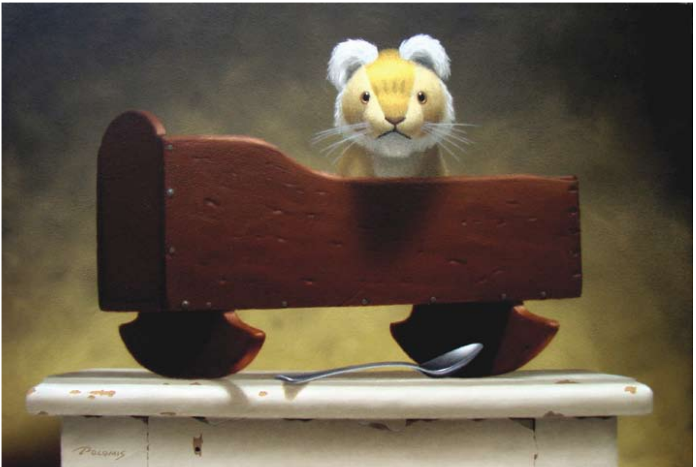
TED POLOMIS, CAT'S IN THE CRADLE, OIL ON PANEL, 12 X 18"

Painting 16 hours a day leaves little time for LaDuke to go camping or enjoy the ocean, two of his favorite pastimes. In these new works, inspired by an urge to