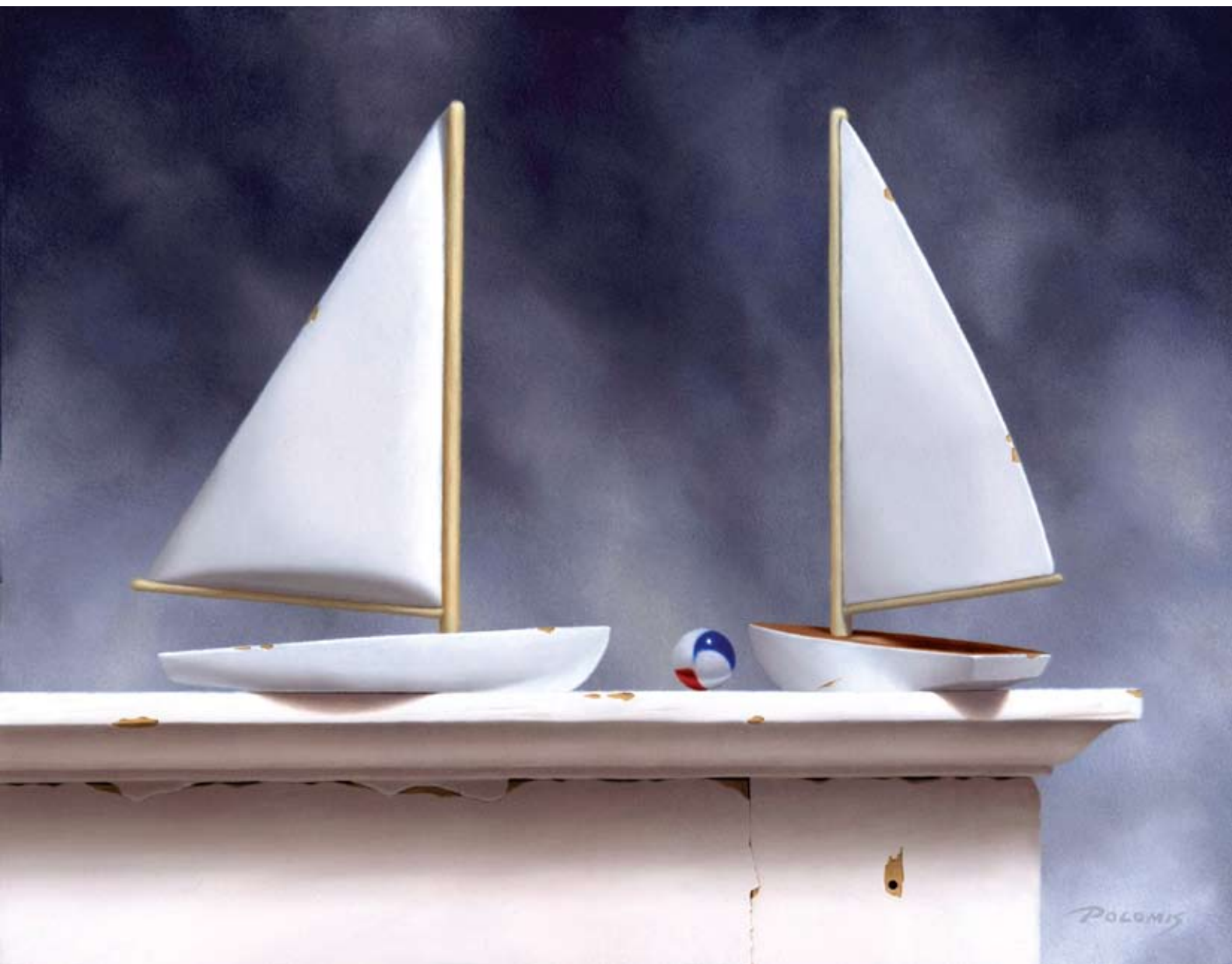
TED POLOMIS, MATCH RACE, OIL ON PANEL, 14 X 18”

in these latest works, explores a variety of canvas sizes, including several square and vertical pieces.