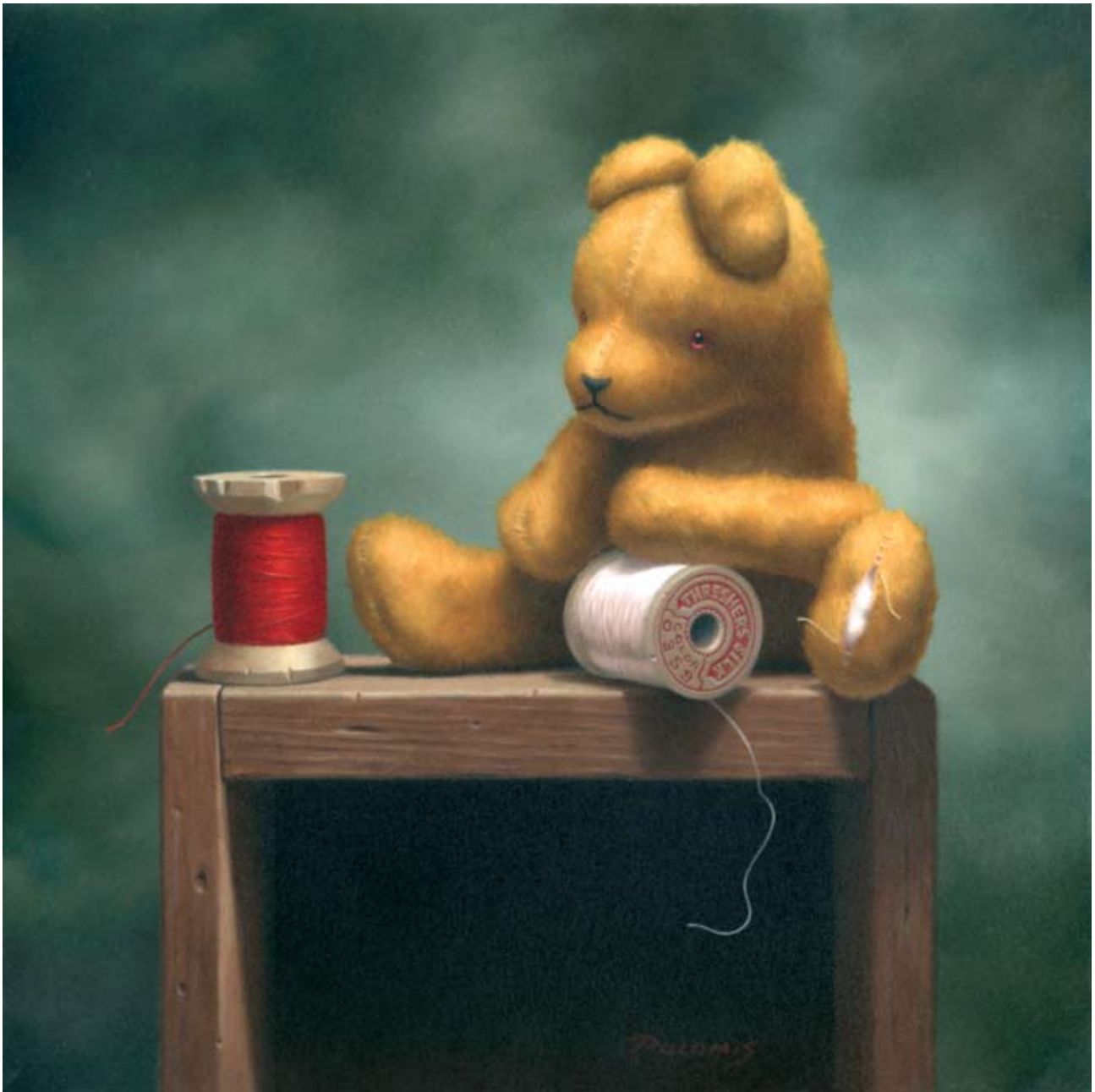
TED POLOMIS, THREAD BEAR, OIL ON PANEL, 12 X 12"