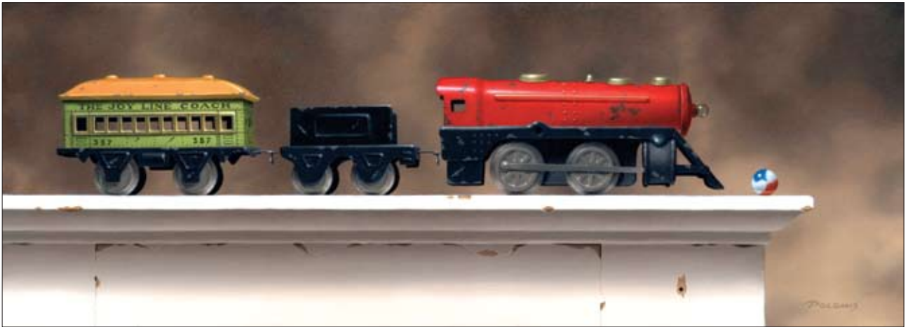
TED POLOMIS, END OF THE LINE, OIL ON PANEL, 9 X 25"