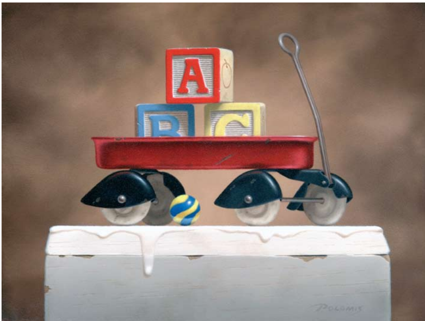
TED POLOMIS, LETTER CARRIER, OIL ON PANEL, 9 X 12"