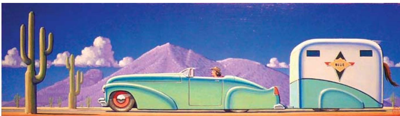
ROBERT LADUKE, PONYTAIL, ACRYLIC ON PANEL, 9½ X 33"